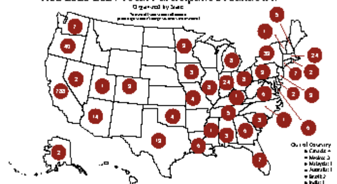
WES 2020-2021 Total Participant Breakdown

Keynoters were former Secretary of State Madeleine Albright, actress/activist Sophia Bush, and 1999 Team USA women's soccer star Brandi Chastain.