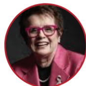
Billie Jean King