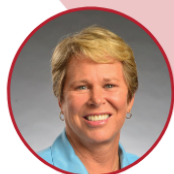
Ann Meyers Drysdale