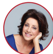
Valorie Kondos Field